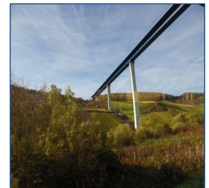
The view of the bridge from below at Rachtig

some sight-seeing, prior to boarding our coach. The proposed cruise down the Mosel had to be cancelled, so it was by road that we headed for Zeltingen and beyond. The beyond took us under the impressive (but not yet quite finished) Hochmoselbrücke and downstream as far as Erden where, apart from viewing an old Roman wine press, we were given an illustrated presentation on the elegant high structure now soaring over the Mosel at Rachtig. Being built ostensibly to facilitate traffic movement between Belgian and Dutch ports and the city of Frankfurt the bridge, with its ten piers, towers over the river at a height of 158 metres, making it the second highest bridge in Europe. However, the construction has certainly caused concern in the immediate area