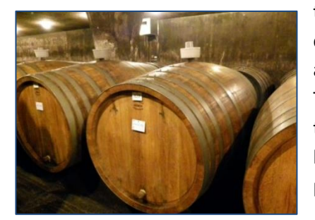
Down in the Bischoflische cellars the Riesling ferments noisily

of a bishop north of the Alps. Along its old city walls is the 4<sup>th</sup> century Porta Nigra (Black Gate), guarding the northern entrance to the town and is the best preserved Roman city gate outside Italy. Our tour of Trier started at the mighty Roman Amphitheatre, built into the city walls and it was most interesting to access the substantial foundations beneath the arena itselfwhich were so well constructed that they have stood the passage of centuries. One particular cellar was utilised for storing animals and also to house prisoners facing death ... possibly at the hands of the gladiators in