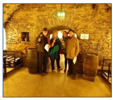
Sampling the wines at the Vinothek

traditional repast (and a glass of Riesling, naturally) we headed back across the bridge into Kues