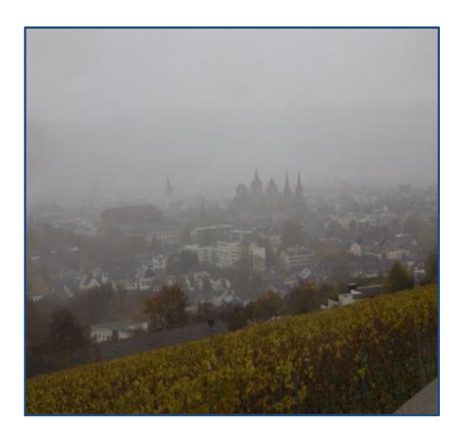
A wet, misty Trier from the vineyards on the Hunsrück

Friday dawned a trifle misty as we boarded the coach for our visit to the old city of Trier near to the Luxembourg border. Originally founded by the Celts in the 4<sup>th</sup> century BC and called Treuorum, it was conquered by the Romans in the late 1<sup>st</sup> century BC and renamed Trevorum or Augusta Treverorum (Latin for "The City of Augustus among the Treveri"). Trier is possibly the oldest city in Germany and was, at the time of the Roman occupation, the largest Roman city outwith Rome itself. It was also the oldest seat